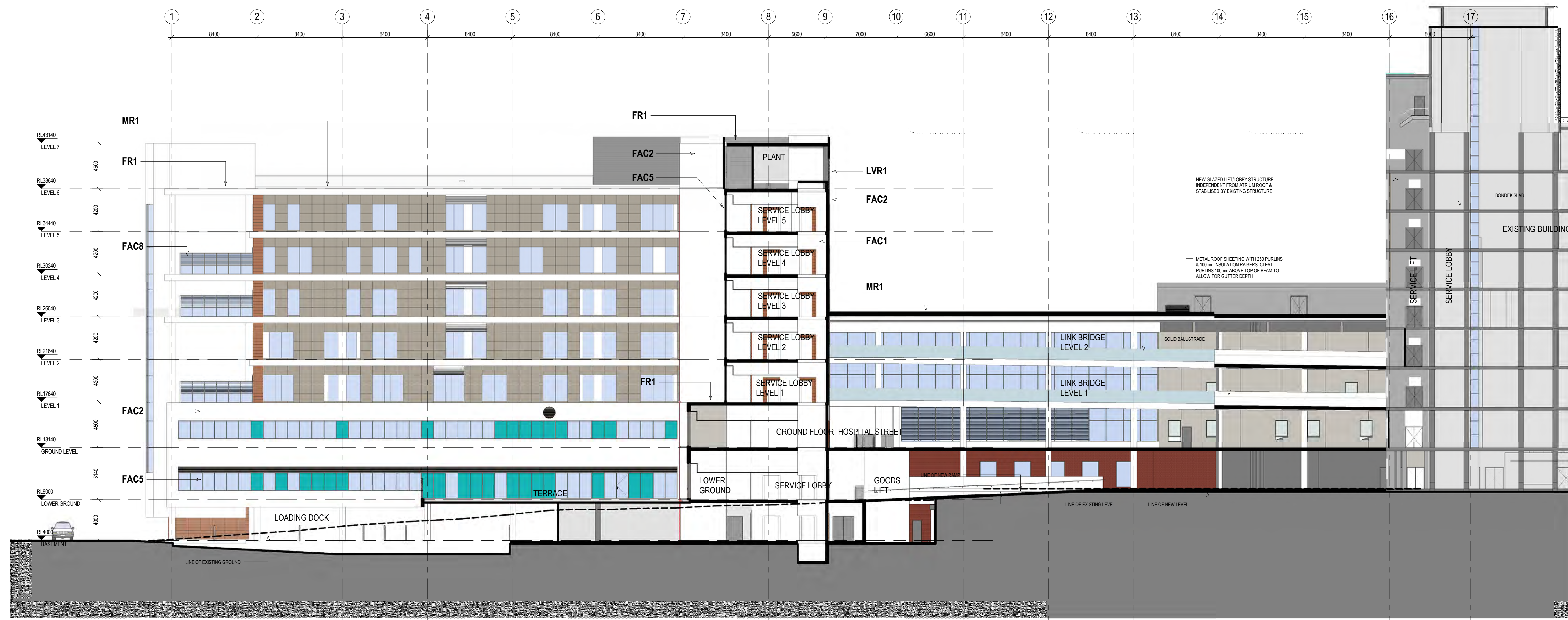
1 SECTION A 15G2 1:200