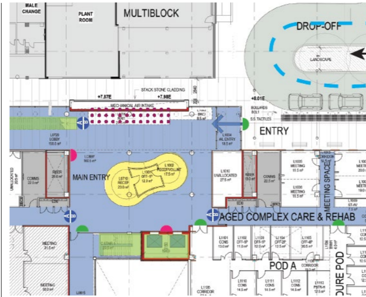
Ambulatory Car Entry Drop Off/Pick Up on Lower Ground.