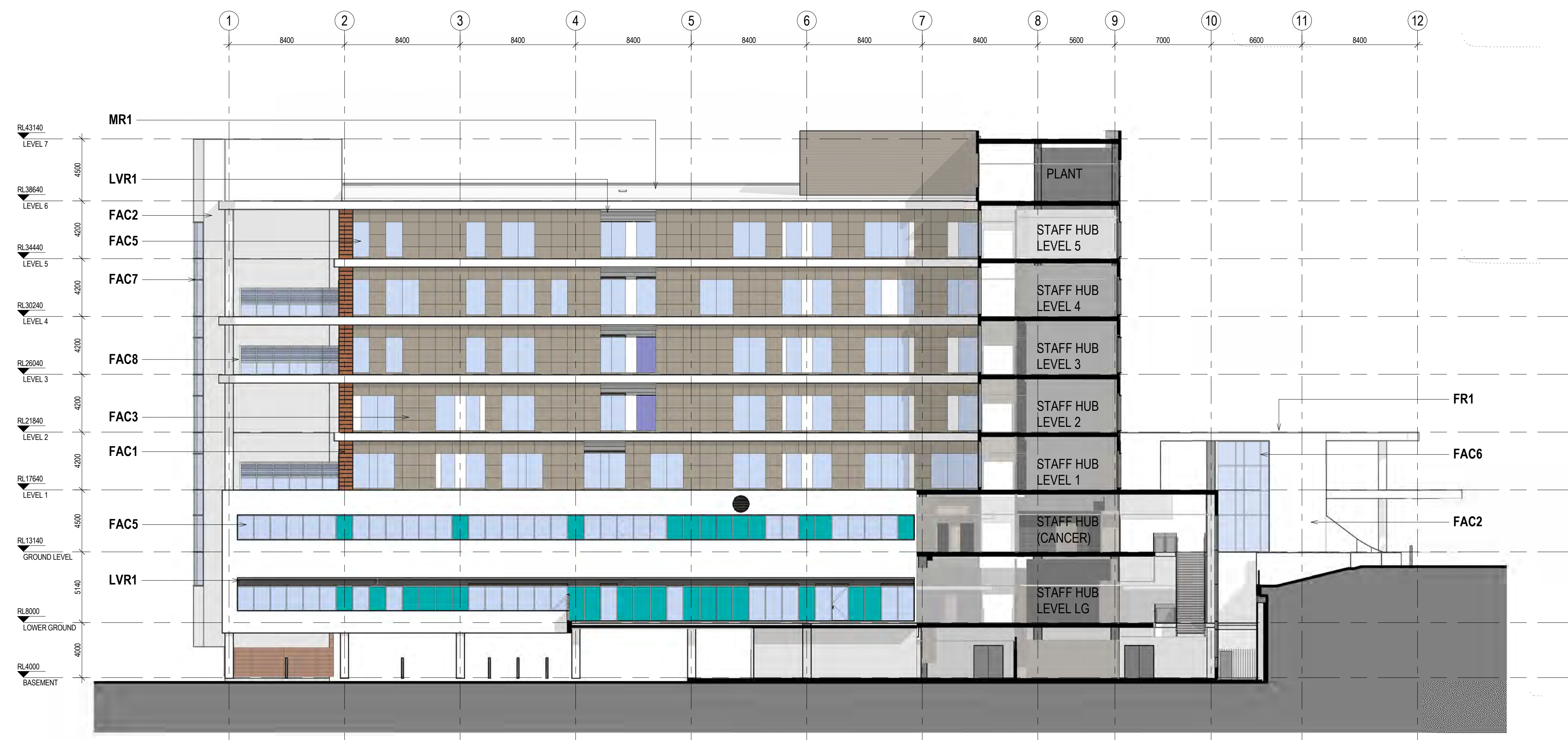
1 IPU 1 - EAST ELEVATION 1:200