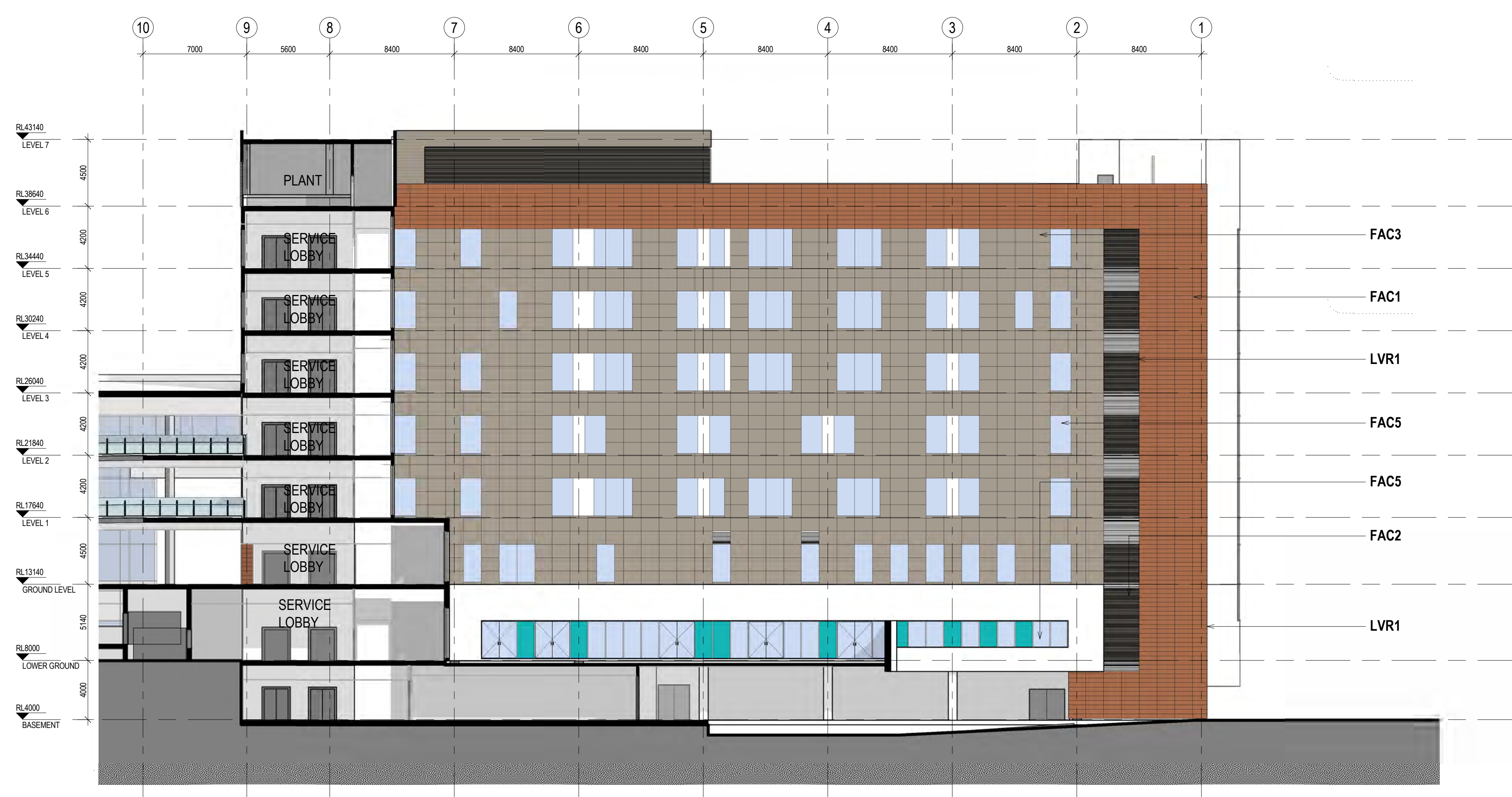
2 IPU 2 - WEST ELEVATION 1:200

NOTES: TO BE READ IN CONJUNCTION WITH SERVICES, STRUCTURAL & CIVIL DOCUMENTATION. ANY DISCREPANCY TO BE BROUGHT TO THE ATTENTION OF JACOBS.