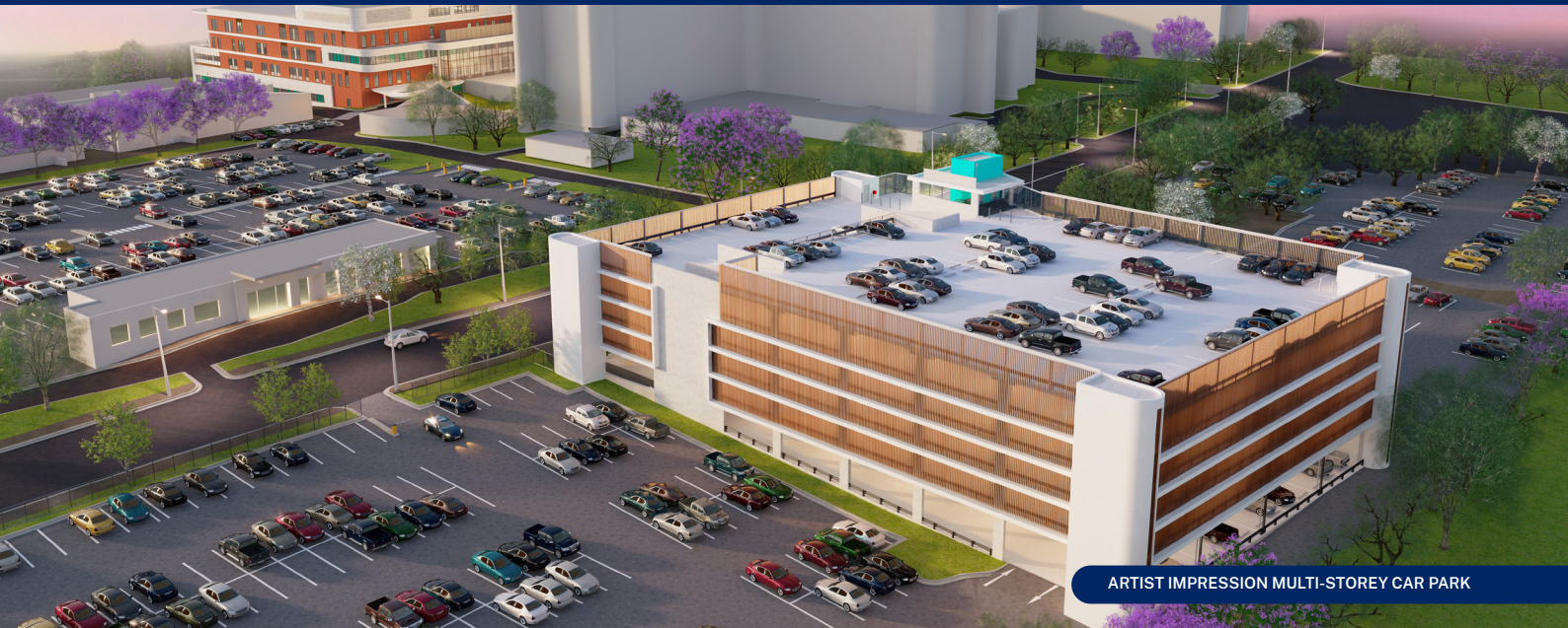
ARTIST IMPRESSION MULTI-STOREY CAR PARK