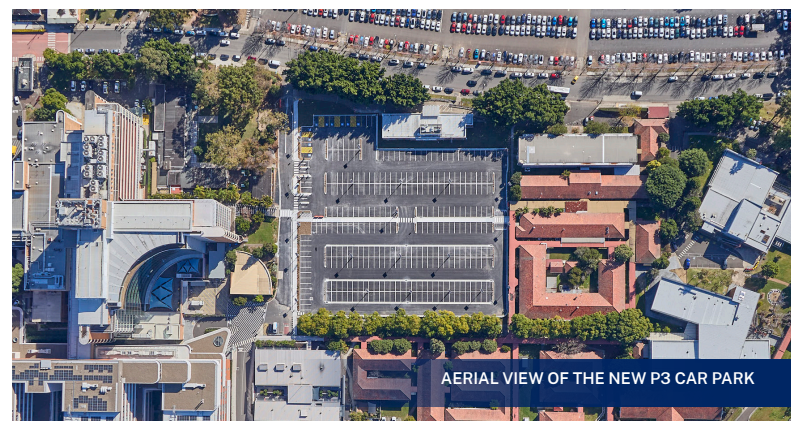
AERIAL VIEW OF THE NEW P3 CAR PARK

The $341 million stage one redevelopment of Concord Hospital included the new Rusty Priest building which expanded and enhanced a range of clinical services.