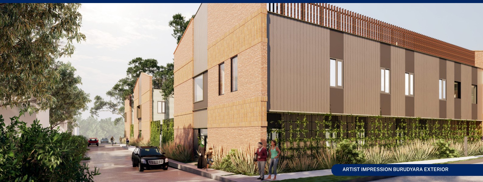
ARTIST IMPRESSION BURUDYARA EXTERIOR